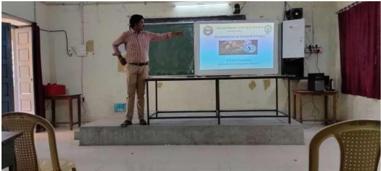
Figure 3: Explaining Cryptography and Block-Chain Technology

After giving a narration on the history of Money, the Lecture continued with the introduction of Cryptography. The meaning of Cryptography, block-chain technology, its usage in Cyberspace are explained.