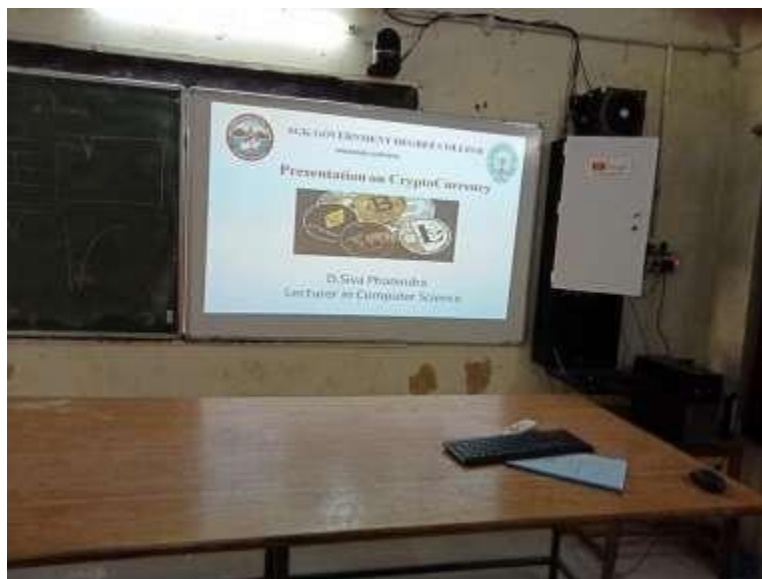
Figure 1: Awareness Session on CryptoCurrency

The Union budget 2022-23 saw the proposal for introduction of Digital Rupee in India. Digital Rupee is a form of Crypto Currency. In order to make students understand the nuances of working of Crypto Currency, Sri. D.Siva Phanindra, Lecturer in Computer Science took a session on “Awareness of Crypto Currency”.